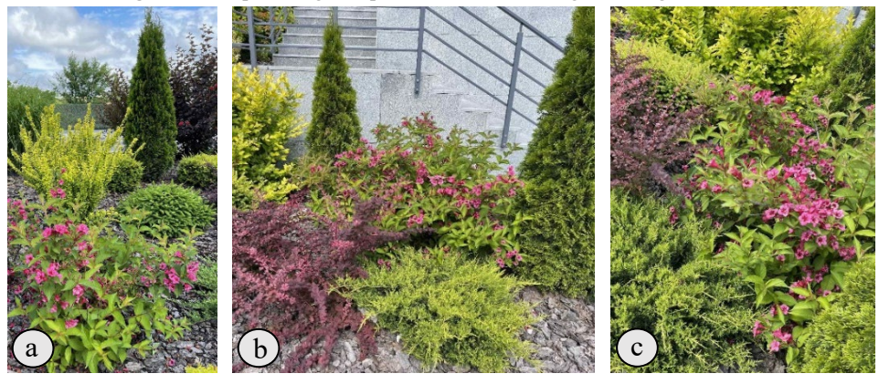
Figure 5. The use of Weigela Thunb. taxa in green spaces in contrast to other species