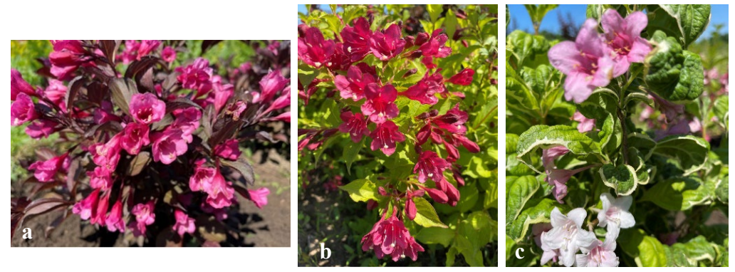
Figure 1. Taxa in the flowering stage in the third growing season. a. Weigela florida 'Alexandra'; b. Weigela florida 'Carlton'; c. Weigela florida 'Caricature'

This shrub is recommended for sunny places, tolerates and partial shade, is generally undemanding to the soil, but requires a medium drained and moist soil. Any care work is done immediately after flowering, because the shrub blooms on the shoots of the previous year. Its neat and fine appearance allows it to be planted alone or in pure groups. Because the fruits and autumn foliage are less attractive, this cultivar should be accompanied by other species to extend the period of decorativeness. It withstands the winter conditions in our country without major damage, sometimes only the tops of the annual shoots can be slightly affected (Figure 5a, b, c).