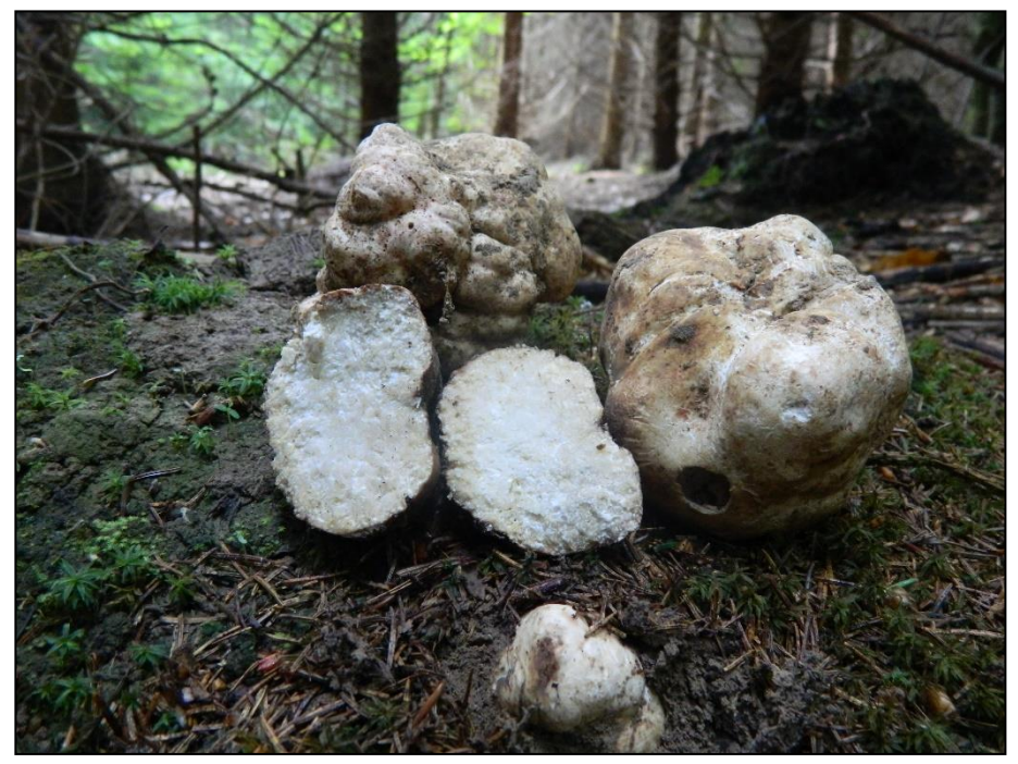
Figure 2. Macroscopic aspect of analyzed specimens of Choiromyces meandriformis

The favourable conditions for this species in Northern Romania were represented by the temperate climate, more humid during all seasons, soil characteristics and vegetation type (forest vegetation with Picea abies in different age stages). Soil analysis (Table 1) highlighted the species' preference for acidic soils (pH 5.06), with a medium content of humus, total nitrogen, potassium and total phosphorus, and a reduced amount of organic matter. These results in agreement (acid soil, wet site, spruce forest) with RODRIGEZ'S (2008) findings who identified the species (in Spain) also in acid and clay soils, in areas with increased rainfall, forming mycorrhizae with common oak ( Quercus robur L.) and spruce ( Picea abies ).