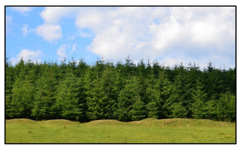
Figure 3. General aspect of the habitat (young Picea abies forest) where Choiromyces meandriformis was identified

The forest habitat (Figure 3) was characterized by a uniform and species-poor floristic composition, typical to Hieracio transsivanici-Piceetum Pawl. et Br.-Bl. 1939 community (Table 2). Trees layer presented high cover (90%) and was dominated by Picea abies while Sorbus aucuparia, Fagus sylvatica, Betula pendula, Acer pseudoplatanus were sporadically identified. The shrubs layer (with Corylus avellana and Spiraea chamaedryfolia ) had very low cover (3-5%). Herbs layer was also species-poor, and had low cover (2-10%) with Luzula luzuloides, Salvia glutinosa, Geranium robertianum, Euphorbia amygdaloides, Veronica officinalis etc. among the most frequent species.