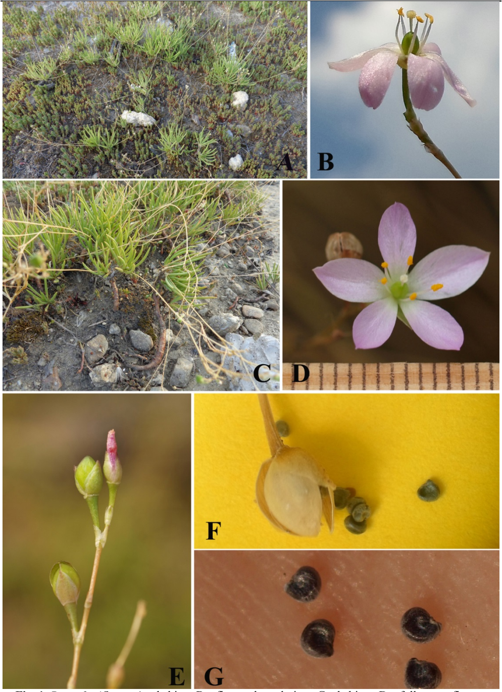
Fig. 1. P. confertiflorus. A – habitat; B – flower, lateral view; C – habitus; D – fully open flower, frontal view; E – sepals persistent in fruit; F – fruit capsule dehiscing by three valves; G – seeds.