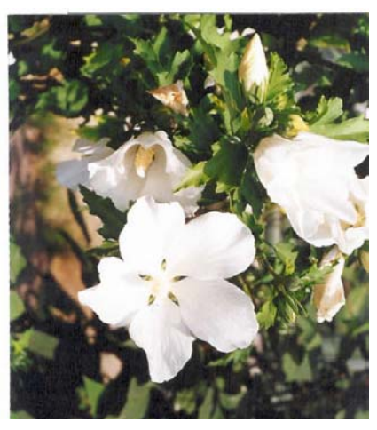
Hybiscus syriacus L.