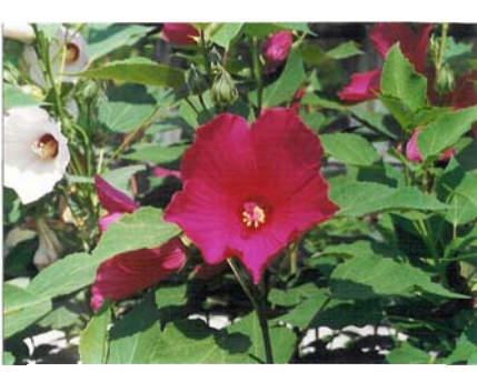
Hybiscus moscheutos L.