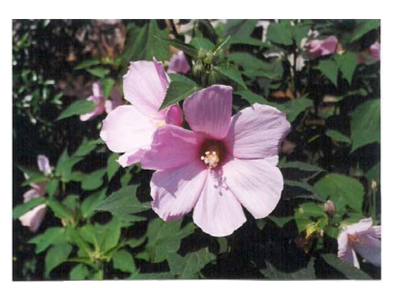
Hybiscus moscheutos L.