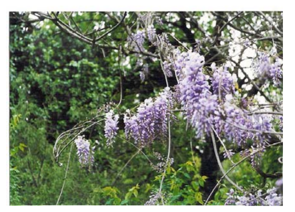
Wisteria sinensis (Sims.) Sweet.