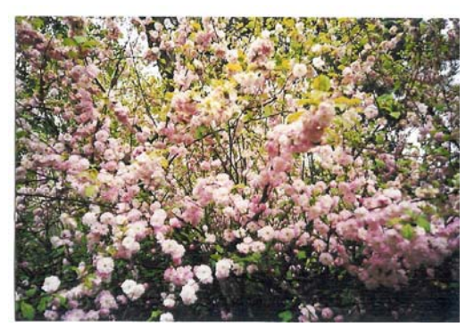
Prunus triloba Lindl.