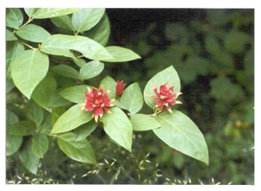
Calycanthus occidentalis Hook. & Arn.