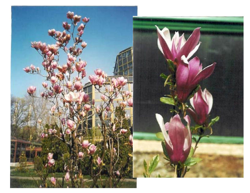
Magnolia soulangeana Lindl.