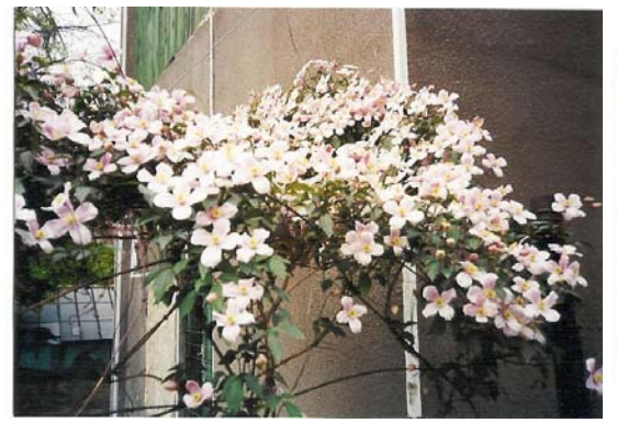
Clematis tangutica (Maxim) Korsh.